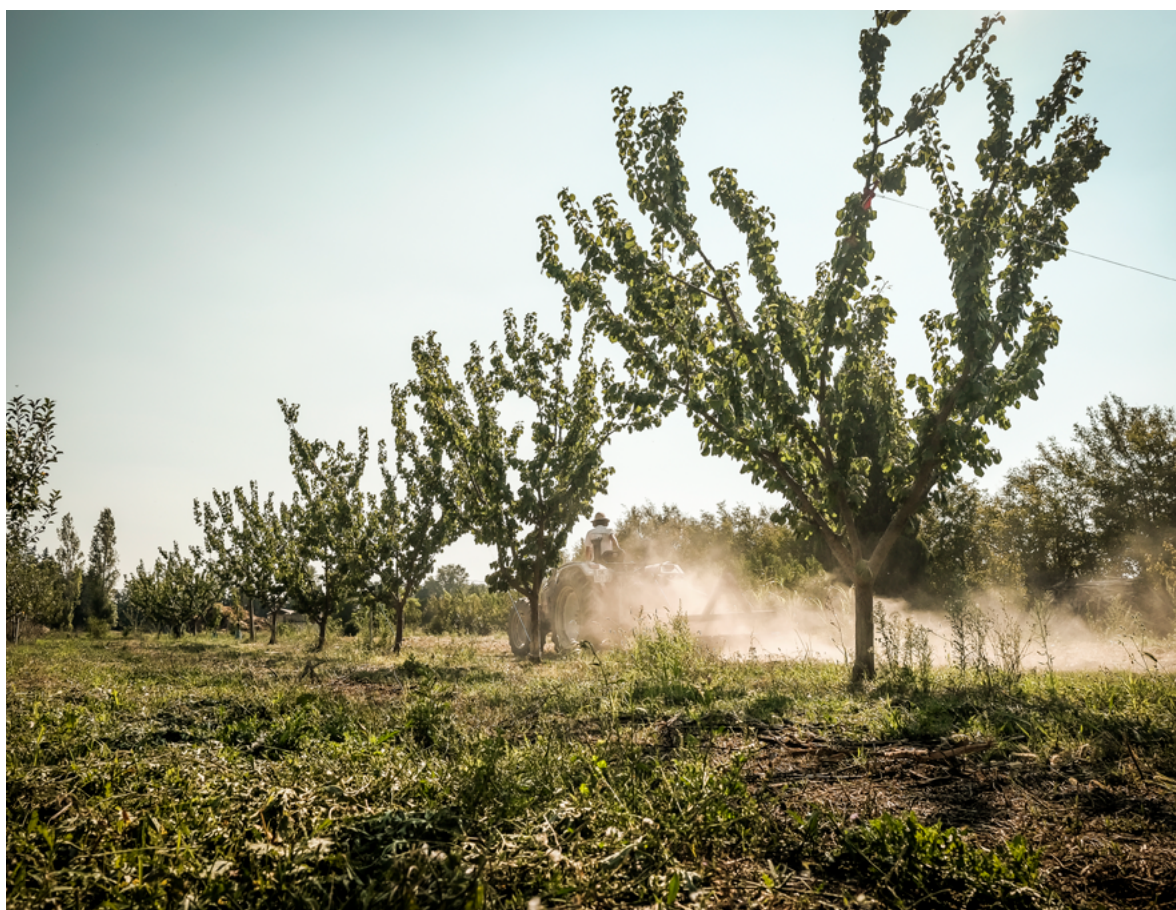
Reportage La Durette

However, these innovative and grassroots solutions are often obscured in over-simplified public conversations around agriculture, and must be supported by policy-makers at every level in order to reach their full potential . This report aims to show some critical policies and practices which can be put in place to support agroecological peasant farmers’ access to land, and therefore support them in implementing their solutions for more resilient and democratic food systems, sustainable livelihoods, flourishing rural and urban communities, and healthy and sustainable food for all.