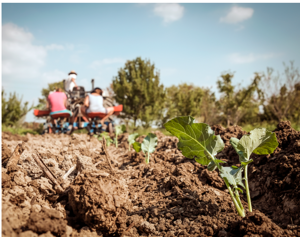
Reportage La Durette

Meanwhile, a thriving ecosystem of policy alternatives is taking root across Europe. From the level of individual farmers and community-level innovations, to local authorities and regional projects to nourish resilient and sustainable food systems built around small-scale agroecological farms, to an ever-growing number of proposals for genuine transformation at the national and EU level, policy-makers across Europe have the power and the opportunity to support a new and transformative vision.