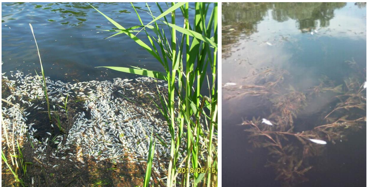
Community members reported seeing dead fish floating in the river near the outflow pipe of the wastewater treatment. Source: Facebook (see further Annex 6).

We are also concerned that other MHP practices may contribute to unknown pollution impacts, such as its use of pesticides and application of used water from poultry houses to irrigate crop land. For example, on 6 May 2017, a local resident witnessed pesticide spraying on a field leased and controlled by the Company across the road from her residence, at a distance of about 10 meters from her land and without prior notice to her. 131 Recently, on 4 May 2018, the same community member again noticed Zernoproduct Farm spraying pesticides close to her residence and without prior notice. This recent incident was again raised through a phone call to MHP's Corporate Social Responsibility team, and after that the spraying did eventually stop, but we fear such incidents may continue to occur. Community members fear that spraying of pesticides may lead to potential pollution of soil and groundwater, as well as unknown health impacts for local residents. Disposal of treated wastewater in the Pivdenny Bug River raises similar concerns. 132 For example, in May 2018 local community members noticed dead fish floating in the river near the outflow pipe of the wastewater treatment plant and we fear that this may have been related to the Company's operations. 133