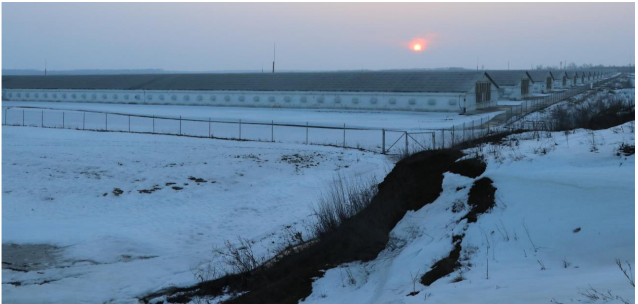
Existing poultry houses within the VPF.