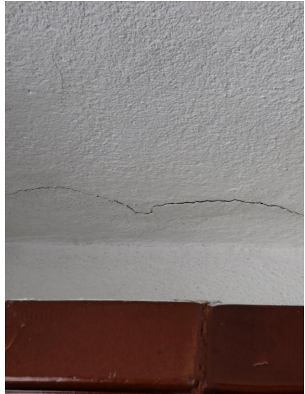
Cracks have appeared in recent years in residents' homes close to the road, both on building exteriors and along the walls and ceilings of interior rooms.

Impacts from MHP's heavy road use were foreseeable. In fact, MHP acknowledged them in meetings with community members in Olyanytsya in 2010. 101 Local residents have made numerous appeals for the immediate construction of the bypass road and other measures to address road impacts, dating back to 2012 or earlier. 102 In one such letter, community members in Olyanytsya again raised concerns about road impacts and presented a series of demands to MHP to address the issue, including construction of a bypass road, major road repairs, construction of sidewalks, speed limits, and an agreement not to construct any new brigades on Olyanytsya lands until these measures are carried out. 103 The Company and local officials agreed to implement all of the requested actions, 104 but to date, we have not seen any real progress.