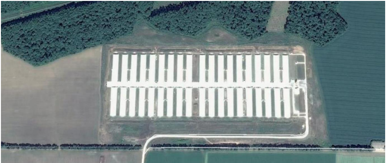
The typical brigade layout. Each brigade requires a total area of 25-30 hectares of land and can house approximately 39,060 chickens at a time.

Each brigade consists of 38 poultry houses and has a capacity of approximately 1,484,280 chickens (broilers), meaning that there are currently as many as 17.8 million chickens being reared in the VPF at any one time. 18