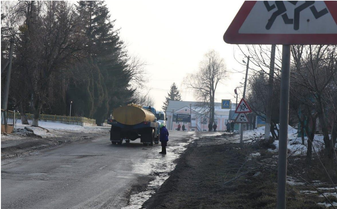
Large vehicles frequently utilize village roads creating risks to pedestrian safety and damage to physical property.

significant negative impacts caused by heavy traffic from large industrial vehicles associated with the Project.