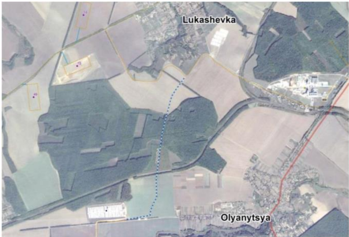
The planned Olyanytsya bypass is indicated by the blue dotted line.

Construction has been delayed time and again for various reasons, despite continuing promises that it will be completed soon. 107 Meanwhile, the Company's construction of VPF Phase 2 facilities has continued on time. We interpret this as a prioritization of MHP's profit-making operations over the interests and wellbeing of local communities.