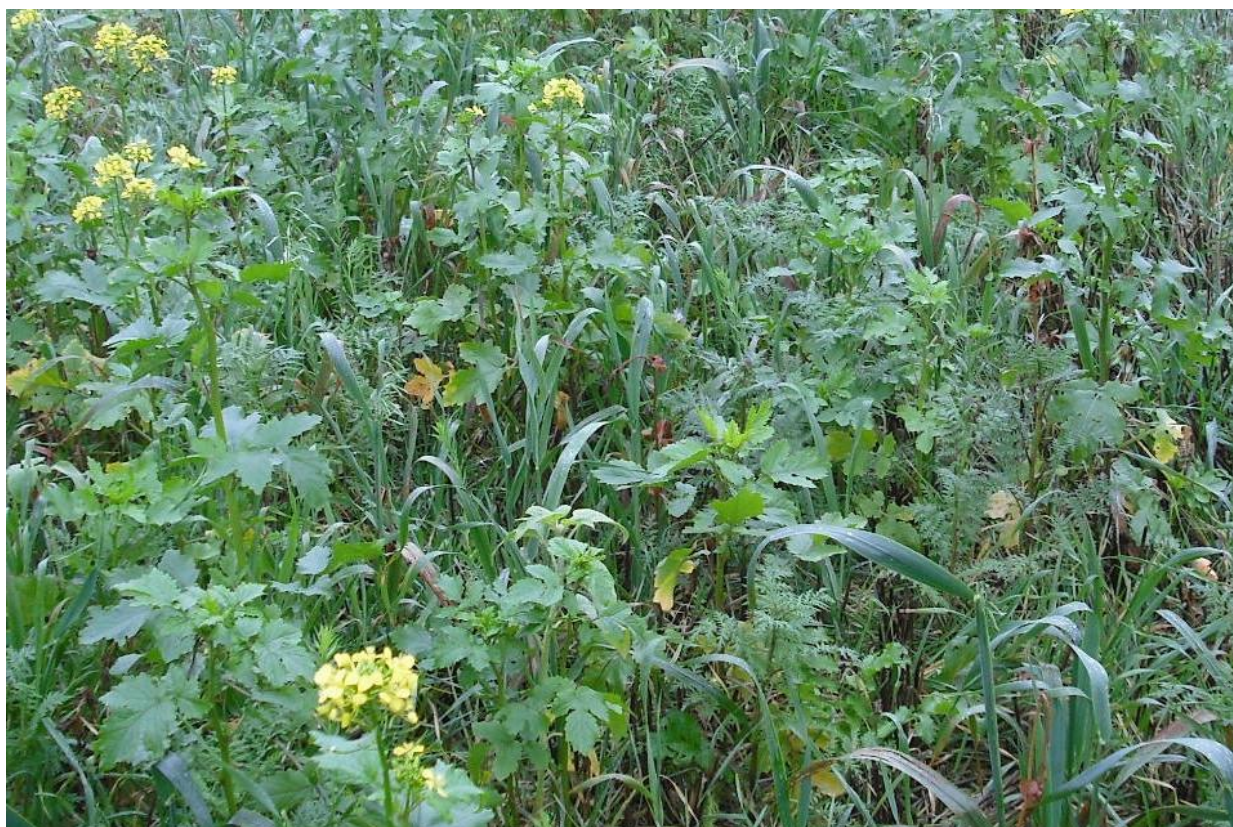
Multi-species winter cover to improve soil health

These actions can help with the long-term productivity and resilience of the soil to benefit food production. They can also provide environmental benefits, such as better water quality, improved climate resilience and increased biodiversity.