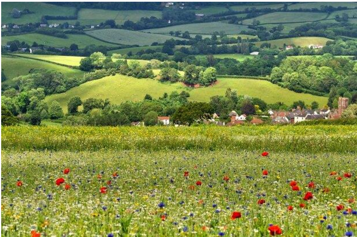
Provide habitat and food sources for farmland wildlife