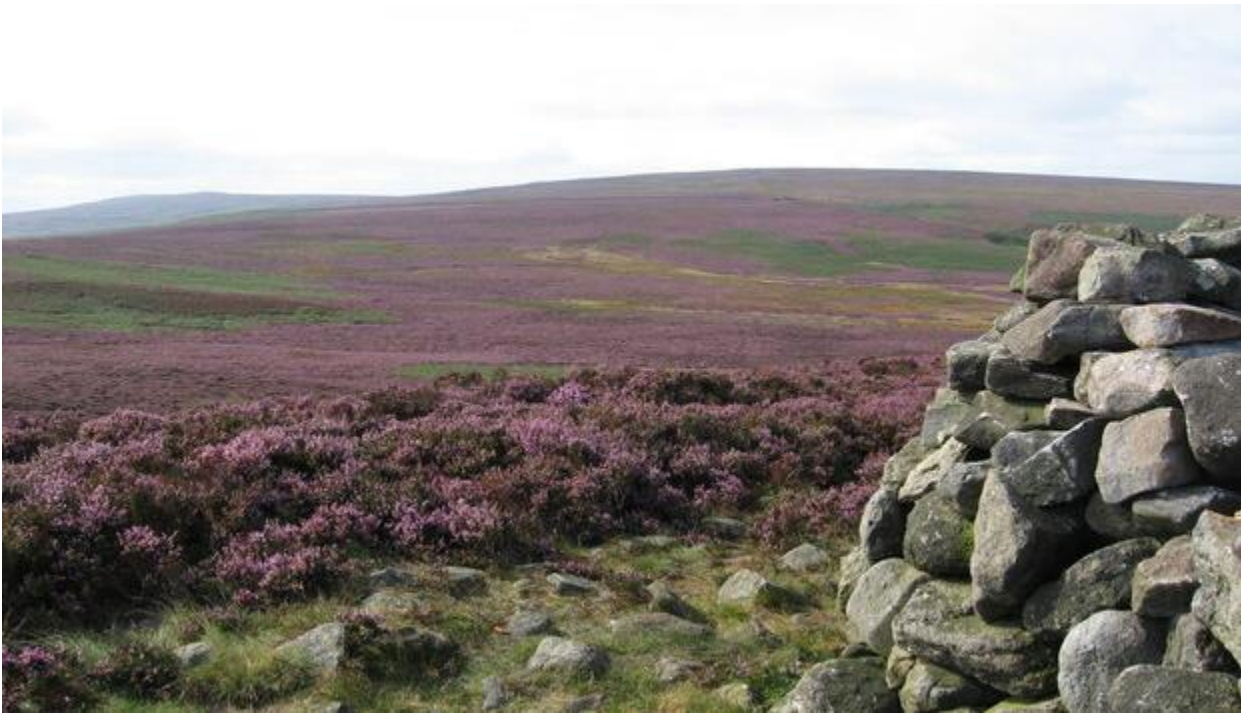
Assess moorland habitat